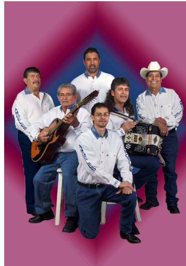
Los Angeles del Sur