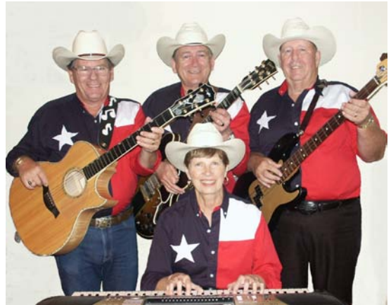
Senior Moments Band